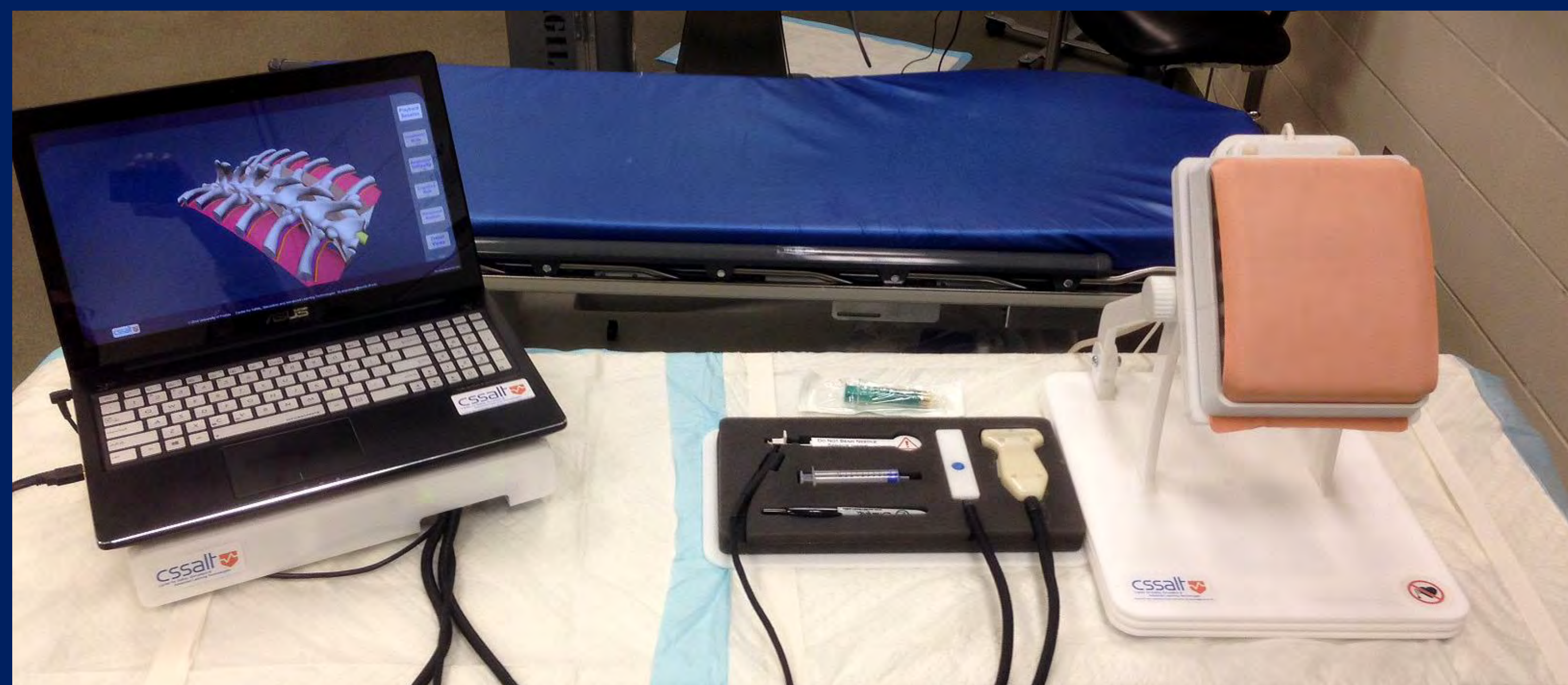
Fig 1. The mixed reality simulator

The main techniques for ultrasound (US)-guided thoracic paravertebral block (TPVB) are sagittal paramedian (SP) and transverse (T, lateral to medial). A goal of TPVB is to safely guide a needle tip into a thoracic paravertebral space without striking the lungs. In TPVB-SP 1 , a sharp needle insertion angle to avoid the transverse processes and an unfavorable insonation beam incidence angle to the lungs make the needle and lungs hard to acquire in an US image. For TPVB-T 2 , the needle and lungs are easier to acquire in an US image but the needle trajectory is towards the neuroforamen and risks spinal cord injury because needle advancement/catheter placement are towards the neuraxis. A technique where the needle and lung are readily acquired in an US image but without aiming a needle at the spine is therefore desirable. In addition, conventional US imaging of 3D anatomy generates 2D cross-sections, creating cross-sectional literacy issues for spatially-challenged users and novices and making it hard, even for experts, to fully appreciate the 3D anatomy as it relates to TPVB.